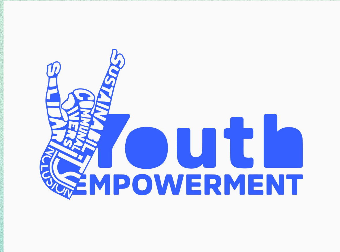
Youth Empowerment Center Thessaloniki, Greece