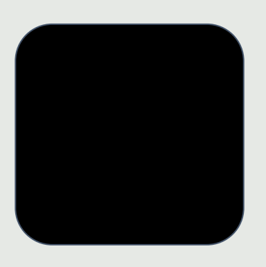
Trainer 3: TO BE ANNOUNCED