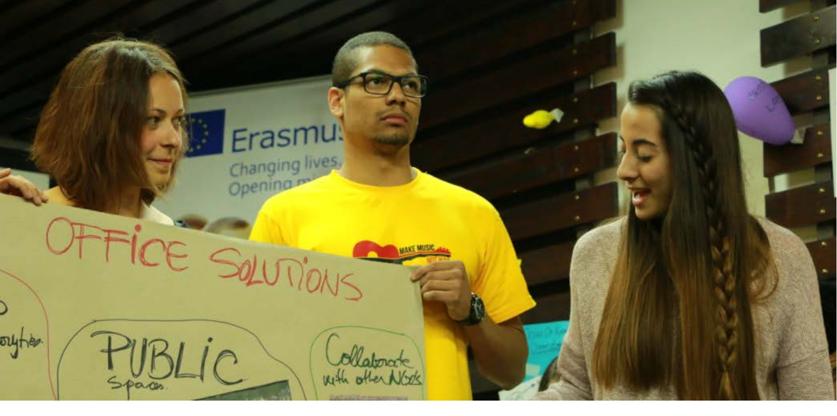
Participants finding creative office solution

During the project sometimes there is no appropriate VENUE for workshops in the accommodation we rented. Then we face the question – where to find a nice, cheap or free venue for our event? Here are some answers that we discovered during the TC: