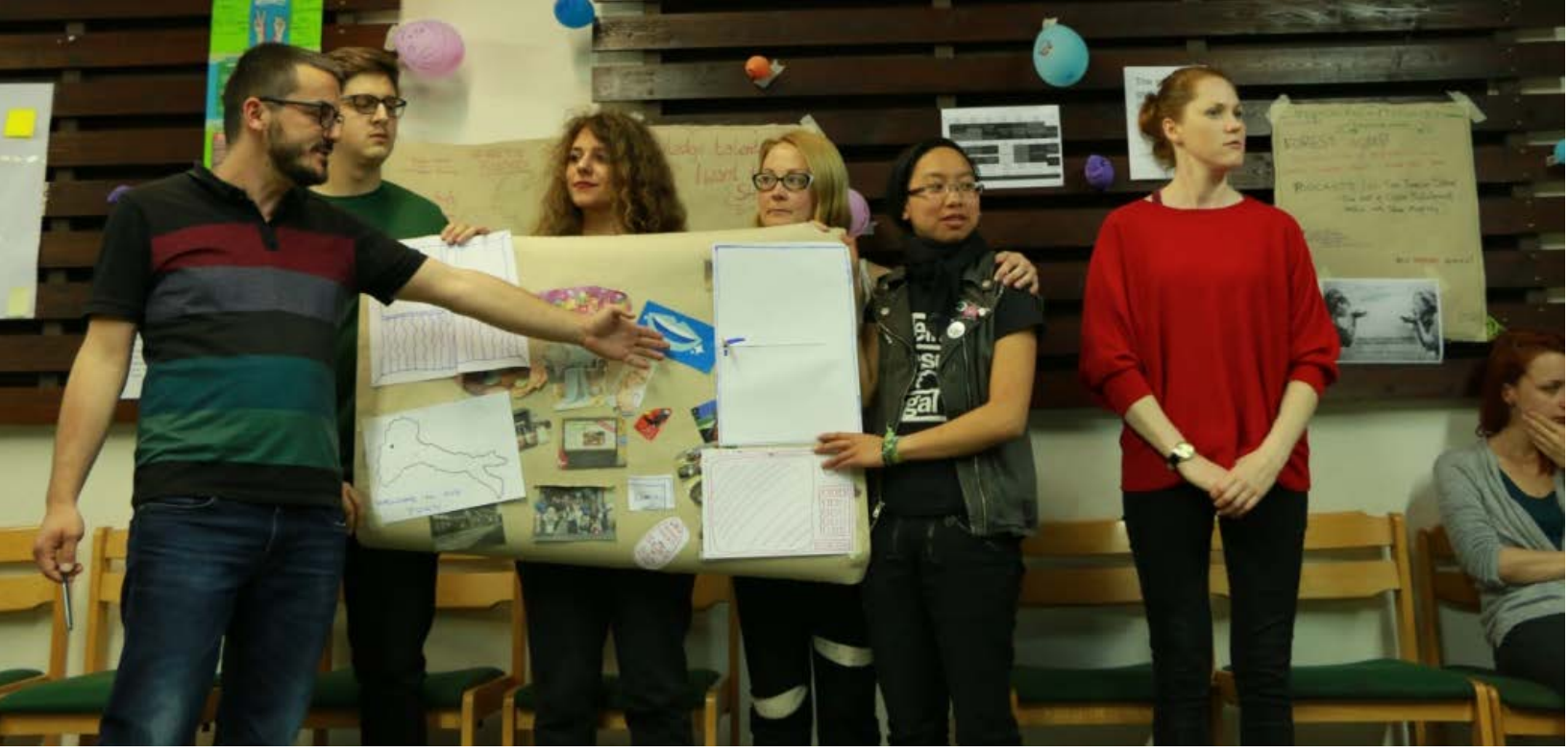
Participants presenting solutions for refugees integration