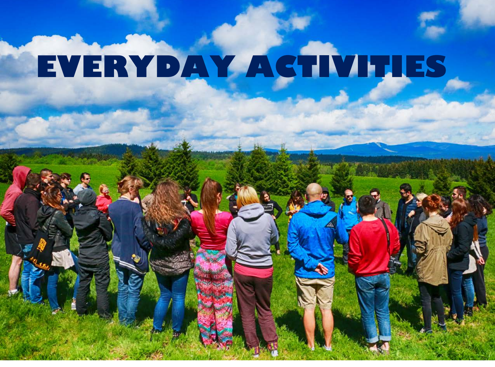
Guerilla solution applied on the project itself: we did some workshops outdoors!

Finally, we were there to implement guerilla solutions to some of the burning EU issues, and most of the time we concentrated on refugees and minority background youth, especially when it comes to their social life in our communities. We found many ways to help them integrate better in the EU society, and European NGOs should take up this role. We should work more on organizing meetings between locals and refugees, providing free language course and intercultural interactions, informing refugees about their rights and opportunities, communicating with local municipalities and their institutions in regard to better position of minorities, etc.